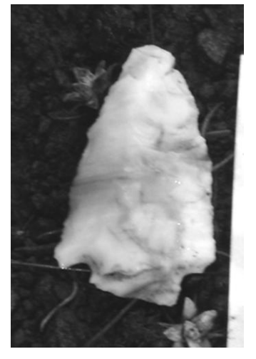
Projectile points (arrowheads) and tools (knives and scrapers)