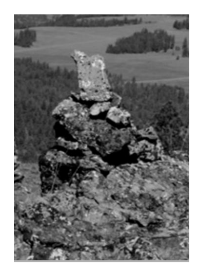
Rock Stack Feature (Cairns, fence lines, fire rings etc)